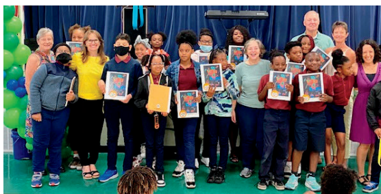
Kids Hope Reading Book Contest '23